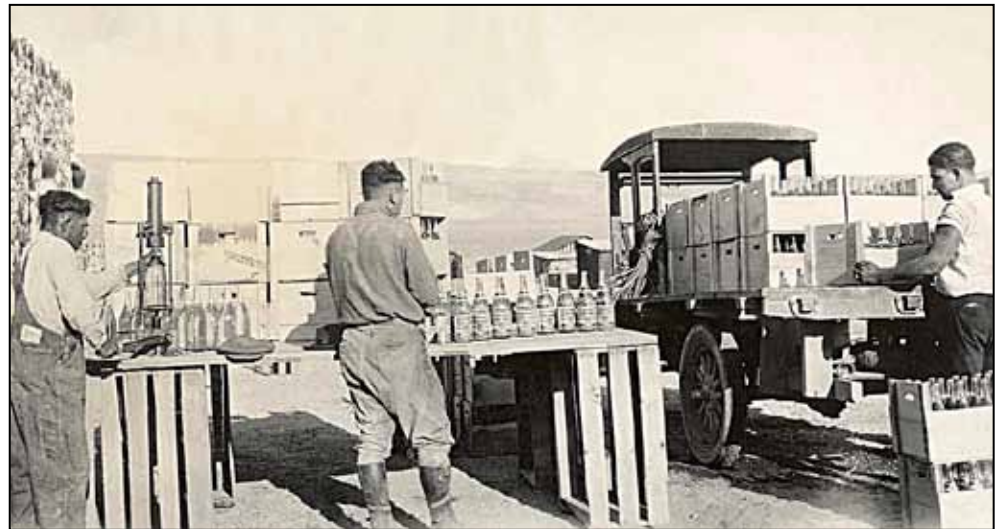
Native American workers at Coso Hot Springs bottle volcanic mineral water. This undated photo probably dates from the 1920s or early 1930s.

Were the Coso waters really effective in curing ailments? Some old-timers who were users claim "Yes." Others had a different opinion.